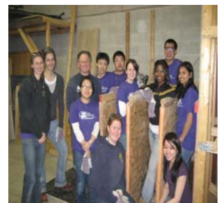
UWO Student Volunteers

- exert from the Garage Sale poem by Tom Zart