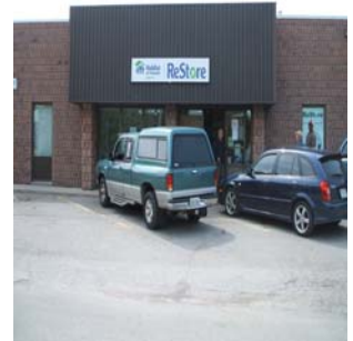
Busy Store Front located at 45 Pacific Court